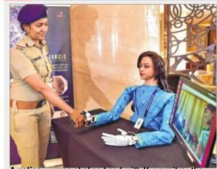
A police woman shakes hand with Vyommithra, the prototype of the half-humanoid made for the first unmanned Gaganyaan mission, at the 2nd day of an international conference on human spaceflights in Bengaluru, Thursday